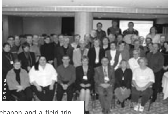
Participants in the North American Periodic Reporting meeting in Quebec

As part of its tourism programme, the World Heritage Centre is hosting its first stand ever at ITB Berlin