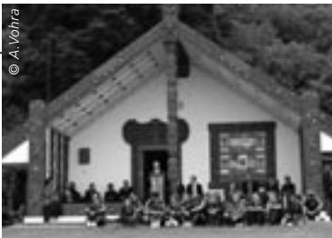
UNESCO Director-General Koïchiro Matsuura at Tongariro National Park